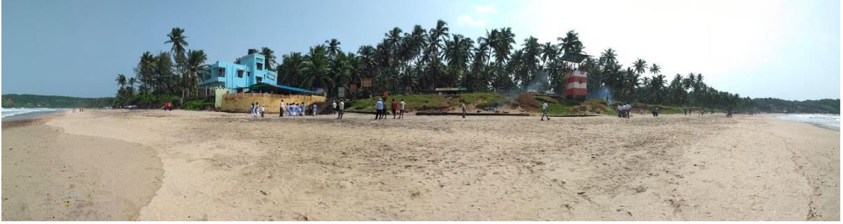
Panoramic view of Velneshwar Beach after clean-up