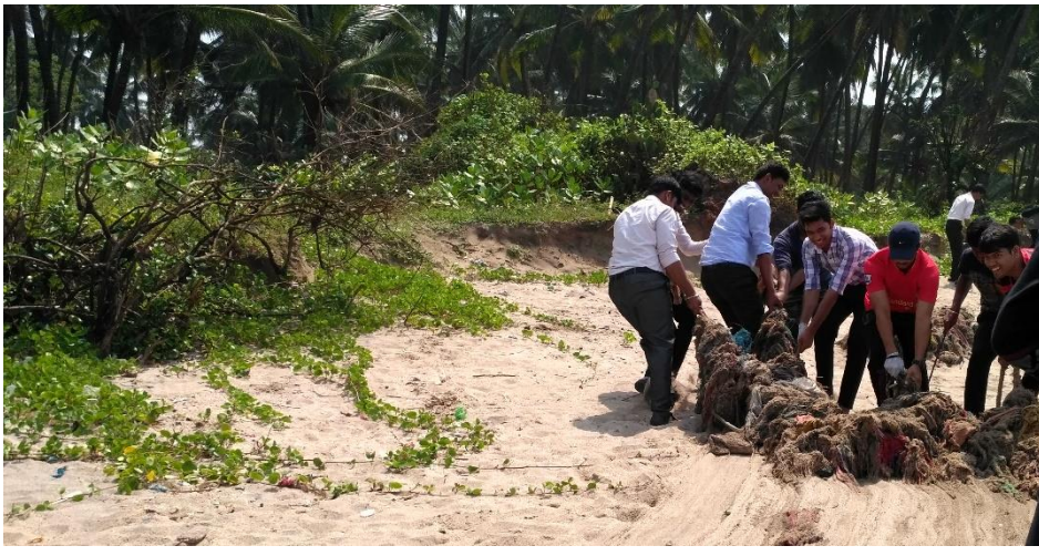
Volunteers during beach cleaning activity