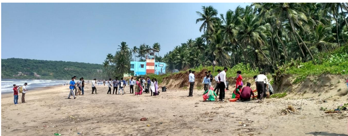
Volunteers during cleaning activity