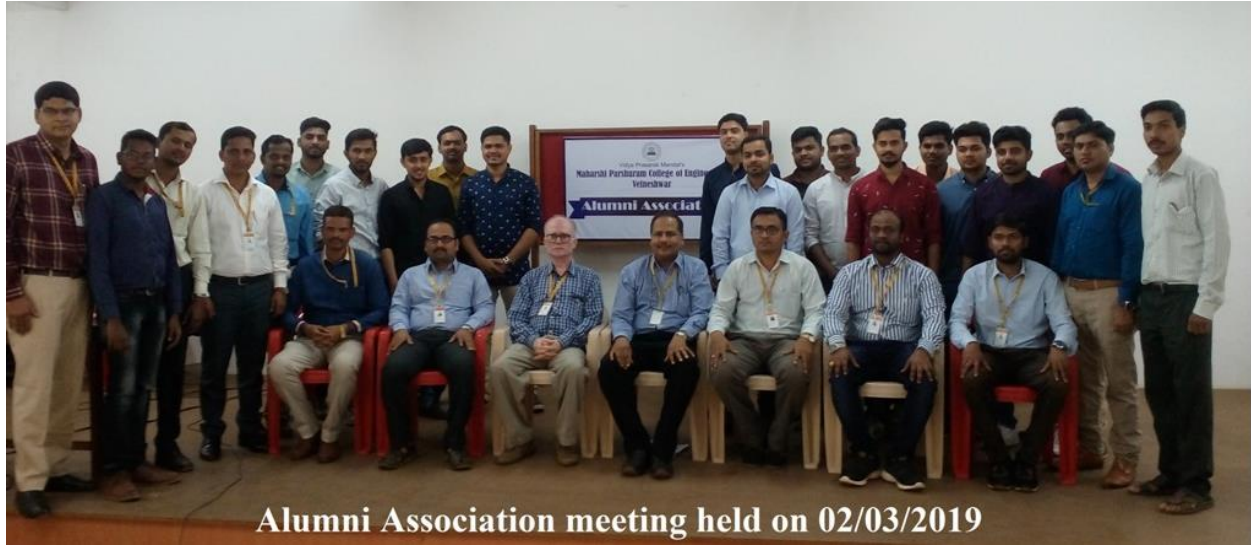
Alumni Association meeting held on 02/03/2019