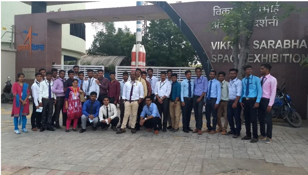
Visit at ISRO Ahmedabad on 26 th September 2017