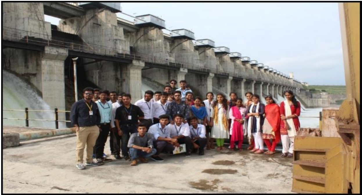
T.E Students visit at Jaykawadi Dam

Department of civil Engineering organized 02 day Industrial Visit from 13 th October 2017 to 14 th October 2017 to Jayakwadi Dam, Paithan, Maharashtra. The Jayakwadi Dam is located on Godavari River at the side of Jayakwadi village in Paithan taluka of Aurangabad district in Maharashtra. Jayakwadi is one of the largest earthen dam in Asia. The purpose of the dam is to irrigate land for agriculture purpose in the drought prone Marathwada region of Maharashtra. The hydroelectric power plant of 12MW Capacity is installed in right bank of the Godavari River. The water used for power generation is pumped back to the main reservoir from the tail pond using Reversible hydro turbine. Here the students studied about general information of dam, spillway, reservoir, different stages of power station and tourism of Jayakwadi.