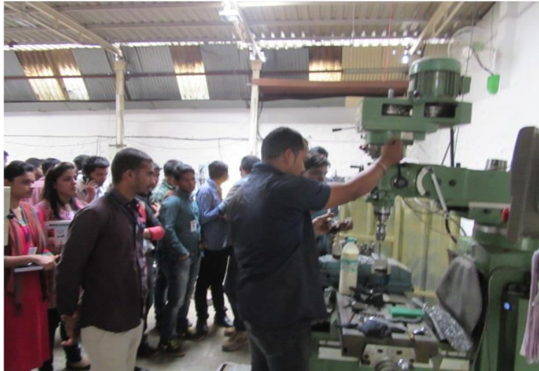
Industrial visit to ACE automation PVT LTD. Bhosari, Pune by department of Instrumentation Engineering on 27 th February 2016.