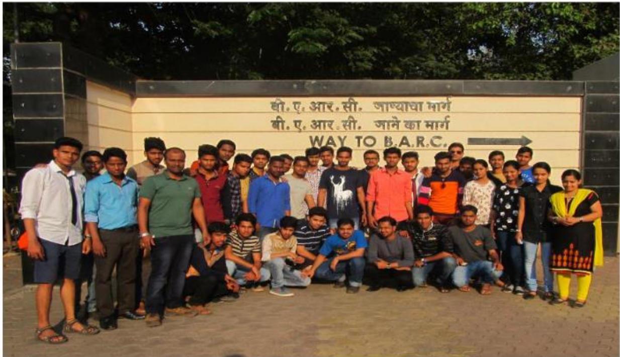
Visit to BARC, Mumbai on 24 th March 2017 by department of Electrical Engineering