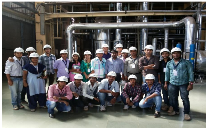
Industrial visit to JSW, Jaygad on 15/2/2014 by Department of Instrumentation Engineering.