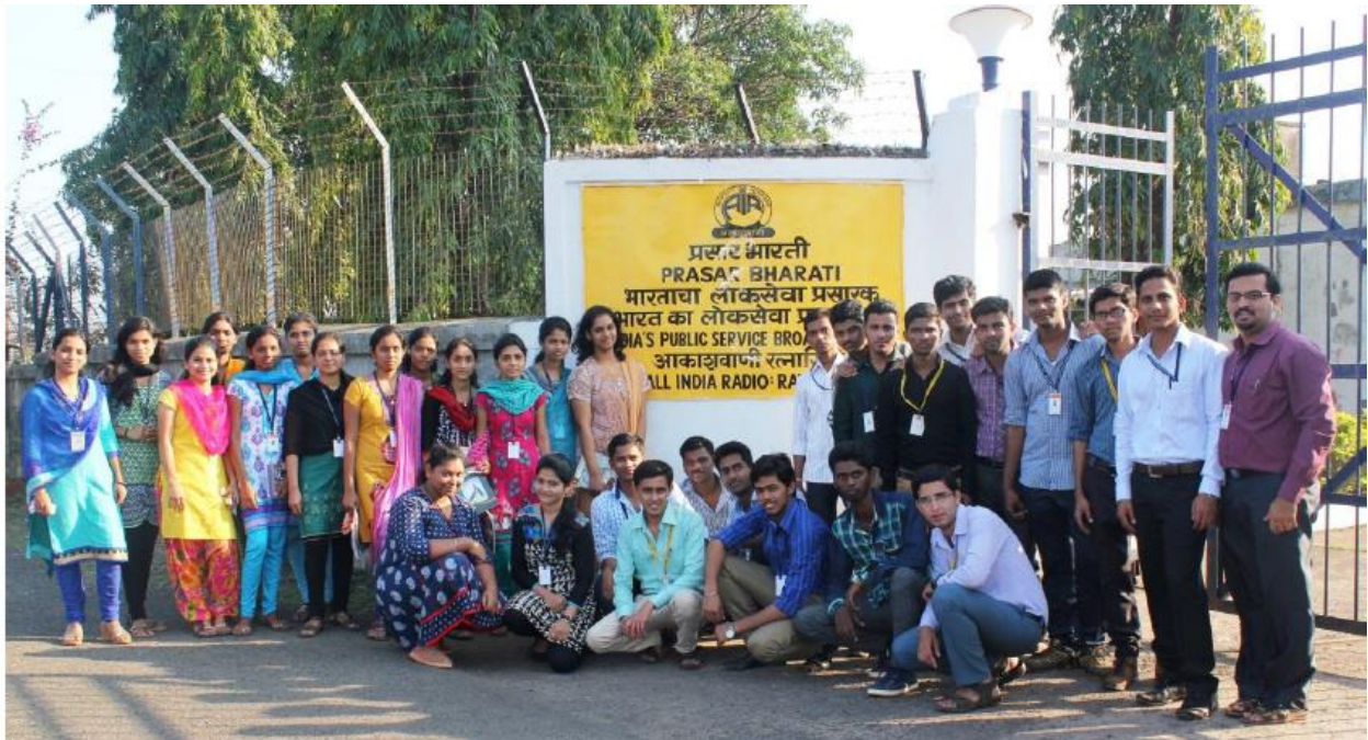
Industrial visit to All India Radio, Ratnagiri on 17 th May 2015 by Department of Electronics & Telecommunication Engineering.