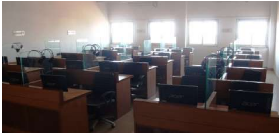
Material Technology Lab.