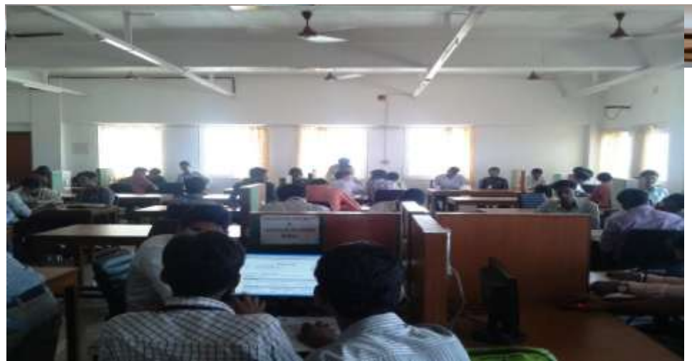
Basic Electrical & Electronics Lab.