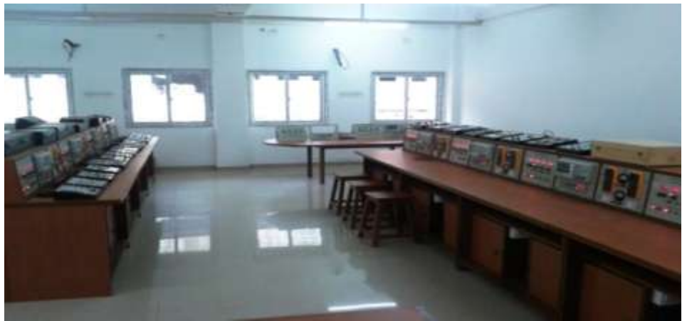
Fluid Mechanics Lab.