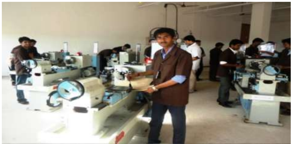
Strength Of Material Lab.